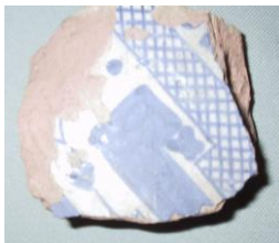
Tile 10 (fragment) 6.6 cms x 6.5 cms and 2.4 cms thick

Tile 10 = This has the same design as one of the Woking Palace blue and white Valencian tiles. This tile was probably acquired by the church after the Palace was abandoned in the 1620s.