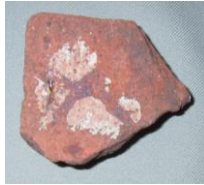
Tile 9 (fragment) 6.2 cms x 6.8 cms and 2 cms thick

Eames design 2353, 2354 or 2355 or something similar.