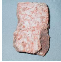
Tile 6 (fragment) 8 cms x 5 cms and 2.1 cms thick

Tile 6 = Glazed Low Countries import 1480-1600