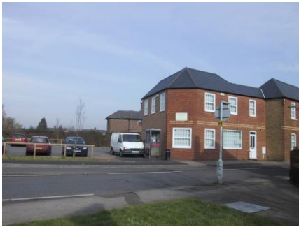
Site of hand and Spear today