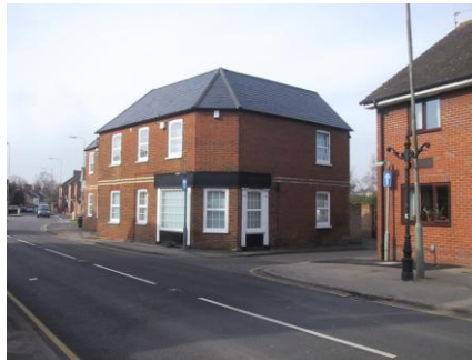
Entrance to St Peter's Road